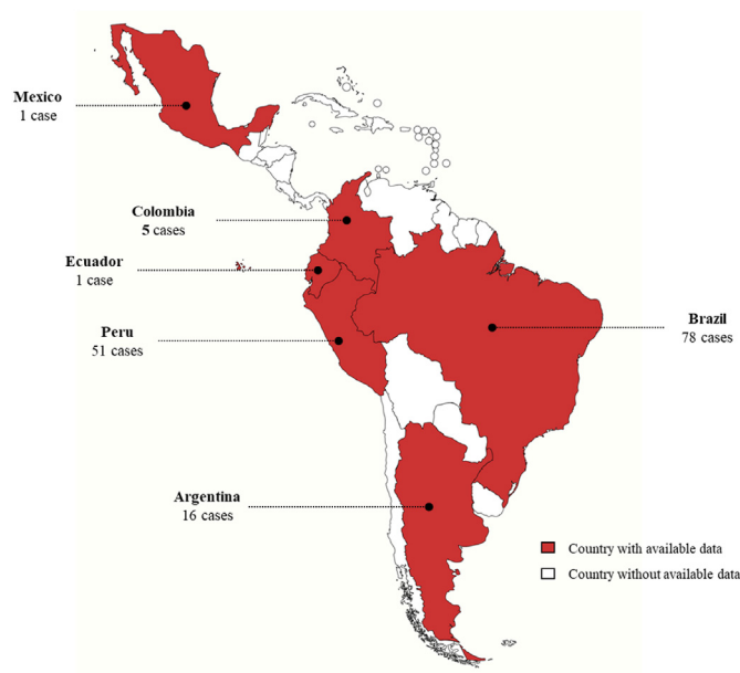
FIG. 2. Cases of co-infection between COVID-19 and dengue in Latin America. Only coinfection cases from Latin American countries reported in selected studies were included. Updated September 4, 2021.

dengue treatment and to ensure that district authorities use these funds effectively [57].