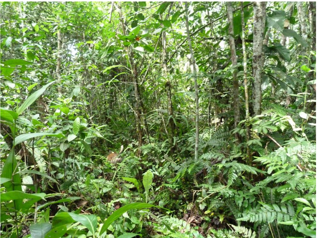
Figure 3. The two sampled swamp forests in Posic. Above: semi-dense to mixed swamp forest (SD); below: mixed swamp forest (MA).