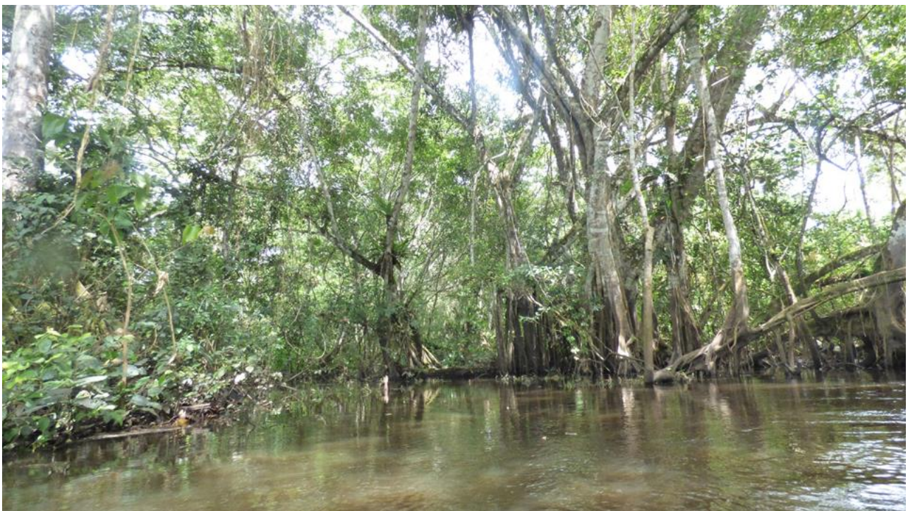
Figure 2. The two sampled swamp forests in ADECARAM, Tingana. Above: semi-dense swamp forest (SA); below: flood-prone area of mixed swamp forest (MI).